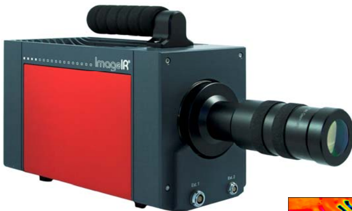
ImageIR® with microscopic MWIR M = 3.0x